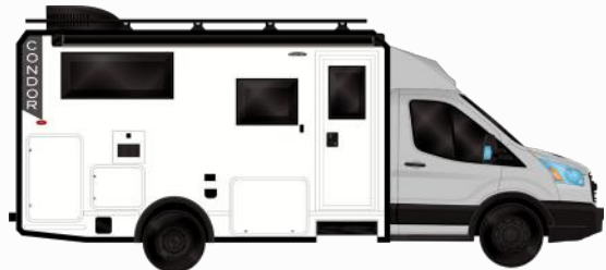
Graphics Delete Option