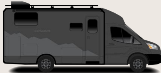
Black Hills Full-Body Paint