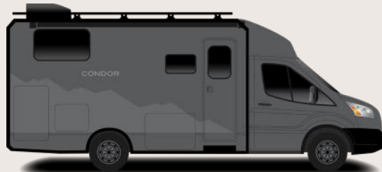
Magnet Full-Body Paint