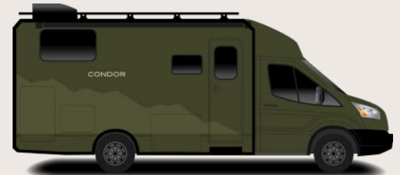
Conifer Full-Body Paint