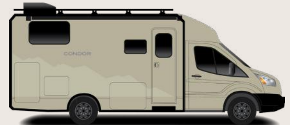
Sandy Oak Full-Body Paint